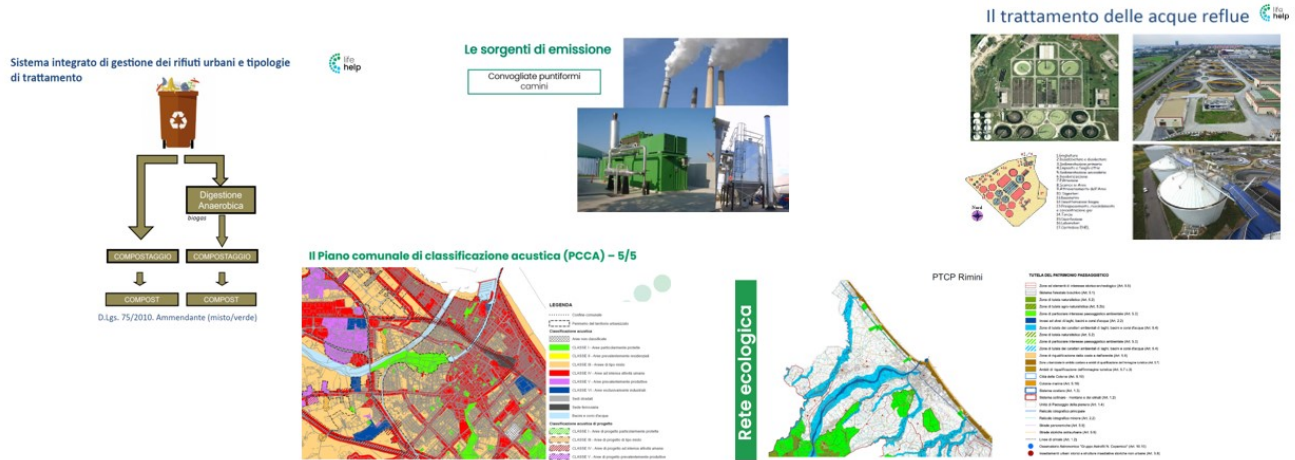
Figure 1: Example of presentations' slides

For each lesson also a brief final test was prepared and submitted to participants.